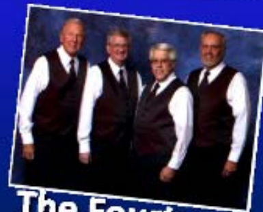
The Fourtune Hunters